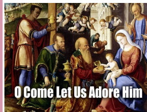
O Come Let Us Adore Him